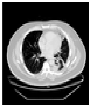
Figure 1. Medical images used

From figure 1 it is observed that images with very high noise content are also being used in this work to check the efficacy of the proposed method.